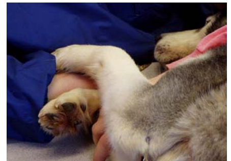
Hold my paw, I'm scared!