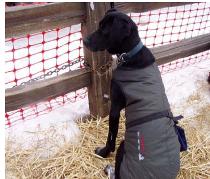
This dog is sporting a new coat