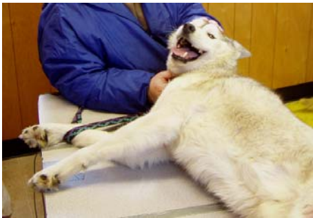
Come on, take my picture.

I want to introduce you to some of my friends who are involved with the Iditarod while I have a few minutes on the computer.