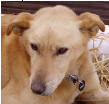
Dropped dog returns to Anchorage