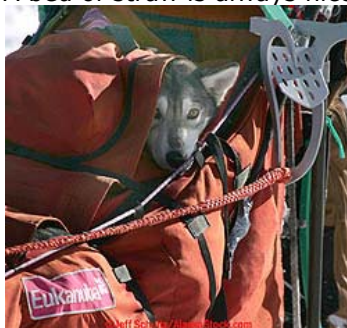
If I hide in here, maybe I won't get dropped