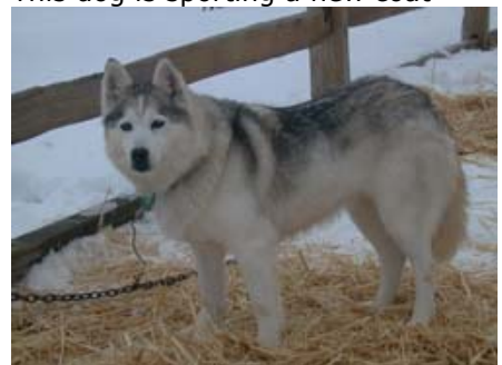
I'm going home and cry for a week.