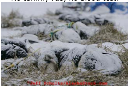
And, I and My friends