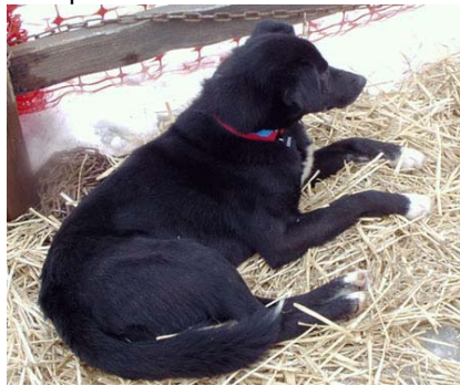
A bed of straw is always nice