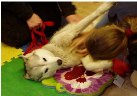
No tummy rub, no blood test!