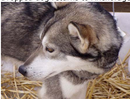
Anyone see where my team went?