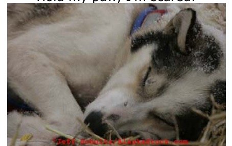
down for a long winter's nap.