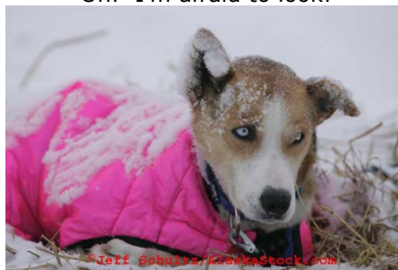
had just settled